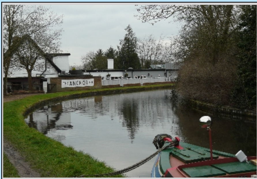
The Anchor, Coven.

Magazine of the Staffordshire & Worcestershire Canal Society