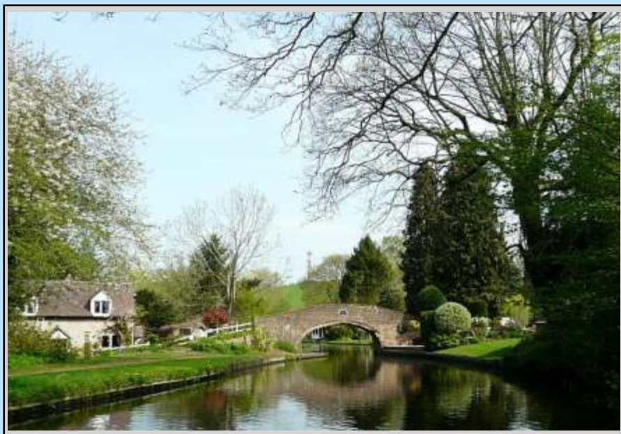
Whittington Horse Bridge

Magazine of the Staffordshire & Worcestershire Canal Society