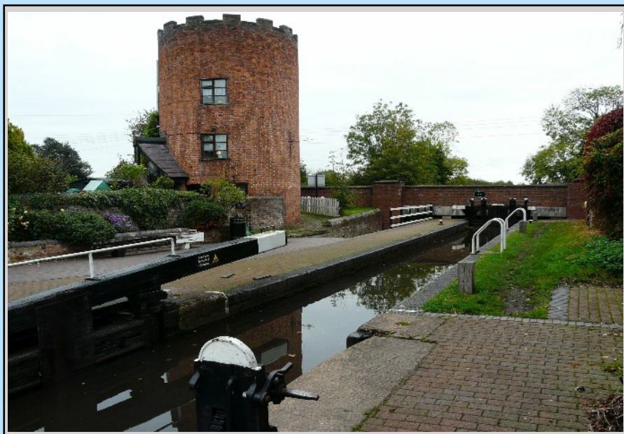
Gailey Round House

Magazine of the Staffordshire & Worcestershire Canal Society