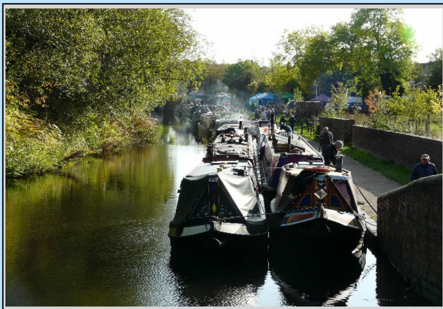
Stourbridge Open Weekend

Magazine of the Staffordshire & Worcestershire Canal Society